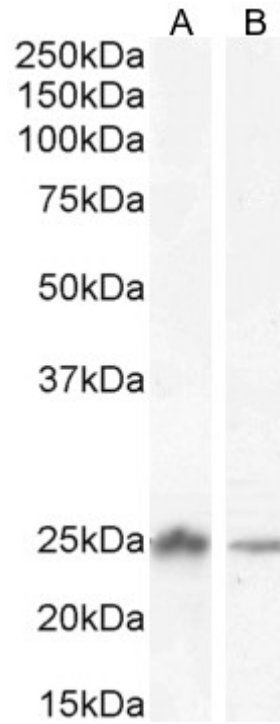
EB06595, (2ug/ml) staining of Human Liver (A) and (1ug/ml) Ovary (B) lysate (35µg protein in RIPA buffer) Detected by chemiluminescence.