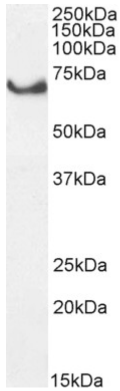
EB05285 (1 \mu g/ml) staining of U937 cell lysate (35 \mu g protein in RIPA buffer). Detected by chemiluminescence.