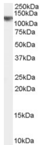
EB07719 (0.5 \mu g/ml) staining of Rat Brain lysate (35 \mu g protein in RIPA buffer). Primary incubation was 1 hour. Detected by chemiluminescence.