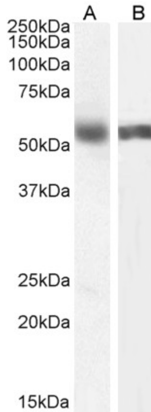
EB11171 (0.5 \mu g/ml) staining of Human Liver (A) and (1 \mu g/ml) Lung (B) lysate (35 \mu g protein in RIPA buffer). Detected by chemiluminescence.