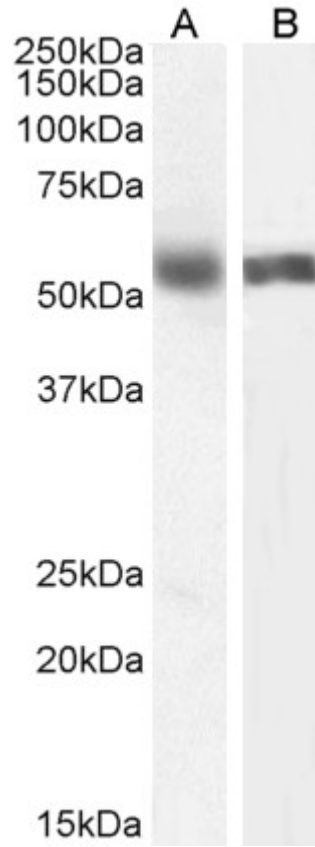
EB11171 (0.5µg/ml) staining of Human Liver (A) and (1µg/ml) Lung (B) lysate (35µg protein in RIPA buffer). Detected by chemiluminescence.