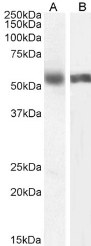
EB11171 (0.5µg/ml) staining of Human Liver (A) and (1µg/ml) Lung (B) lysate (35µg protein in RIPA buffer). Detected by chemiluminescence.