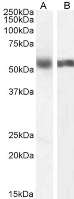
EB11171 (0.5 \mu g/ml) staining of Human Liver (A) and (1 \mu g/ml) Lung (B) lysate (35 \mu g protein in RIPA buffer). Detected by chemiluminescence.