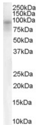
EB06750 (0.1 \mu g/ml) staining of Human Bone Marrow lysate (35 \mu g protein in RIPA buffer). Primary incubation was 1 hour. Detected by chemiluminescence.