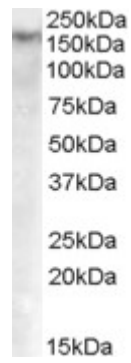
EB08317 (0.5 \mu g/ml) staining of Jurkat cell lysate (35 \mu g protein in RIPA buffer). Detected by chemiluminescence.