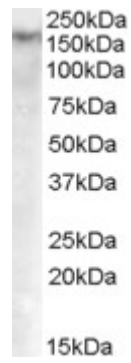
EB08317 (0.5µg/ml) staining of Jurkat cell lysate (35µg protein in RIPA buffer). Detected by chemiluminescence.