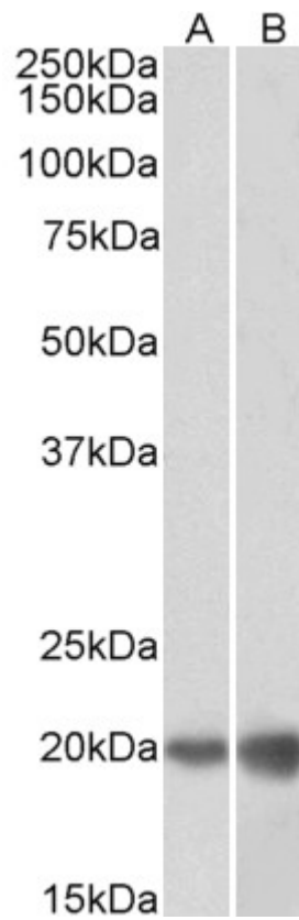
EB12748 (0.1µg/ml) staining of HEK293 (A) and HeLa (B) lysates (35µg protein in RIPA buffer). Detected by chemiluminescence.