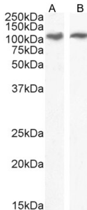
EB08559 (0.3 \mu g/ml) staining of Human Duodenum (A) and (0.1 \mu g/ml) Pancreas (B) lysate (35 \mu g protein in RIPA buffer). Detected by chemiluminescence