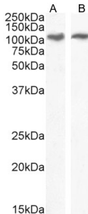
EB08559 (0.3 \mu g/ml) staining of Human Duodenum (A) and (0.1 \mu g/ml) Pancreas (B) lysate (35 \mu g protein in RIPA buffer). Detected by chemiluminescence