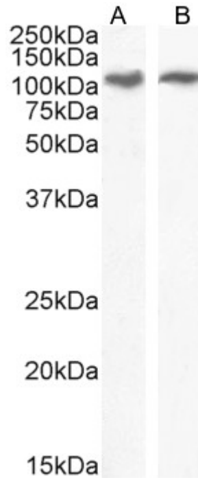
EB08559 (0.3µg/ml) staining of Human Duodenum (A) and (0.1ug/ml) Pancreas (B) lysate (35µg protein in RIPA buffer). Detected by chemiluminescence