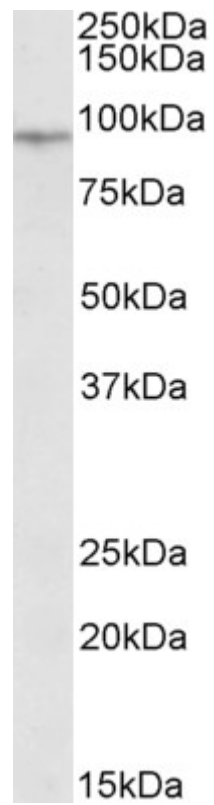
EB09167 (0.3 \mu g/ml) staining of nuclear HeLa lysate (35 \mu g protein in RIPA buffer). Primary incubation was 1 hour. Detected by chemiluminescence.