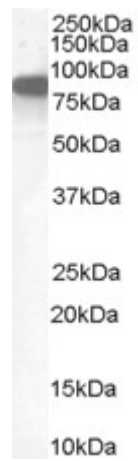
EB07305 (1 \mu g/ml) staining of Human Placenta lysate (35 \mu g protein in RIPA buffer). Primary incubation was 1 hour. Detected by chemiluminescence.