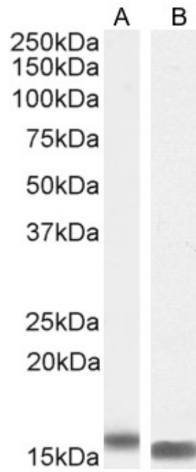
EB07742 (0.001 \mu g/ml) staining of Human Duodenum (A) and (0.003 \mu g/ml) Ileum (B) lysate (35 \mu g protein in RIPA buffer). Detected by chemiluminescence.