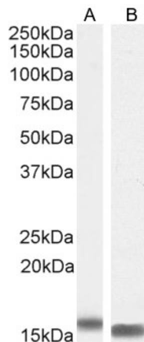
EB07742 (0.001 \mu g/ml) staining of Human Duodenum (A) and (0.003 \mu g/ml) Ileum (B) lysate (35 \mu g protein in RIPA buffer). Detected by chemiluminescence.