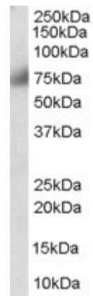
EB06649 (0.3µg/ml) staining of Human Breast lysate (35µg protein in RIPA buffer). Primary incubation was 1 hour. Detected by chemiluminescence.