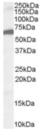
EB06000 (1 \mu g/ml) staining of Human Liver lysate (35 \mu g protein in RIPA buffer). Detected by chemiluminescence.