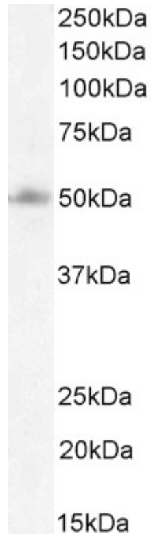
EB05608 (1 \mu g/ml) staining of U251 cell lysate (35 \mu g protein in RIPA buffer). Detected by chemiluminescence.