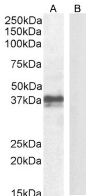
EB10760 (1µg/ml) staining of Mouse Skin lysate (A) + peptide (B) (35µg protein in RIPA buffer). Detected by chemiluminescence.