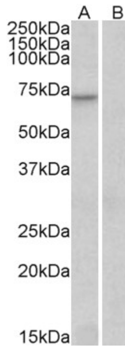
EB06392 (0.3 \mu g/ml) staining of Human Heart lysate (35 \mu g protein in RIPA buffer) with (A) and without (B) blocking with the immunising peptide. Detected by chemiluminescence.