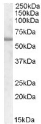
EB08348 (0.3 \mu g/ml) staining of HepG2 cell lysate (35 \mu g protein in RIPA buffer). Primary incubation was 1 hour. Detected by chemiluminescence.