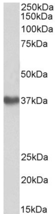
EB12689 (1 \mu g/ml) staining of Human Placenta lysate (35 \mu g protein in RIPA buffer). Primary incubation was 1 hour. Detected by chemiluminescence.