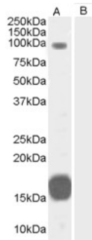
EB06142 (0.3 \mu g/ml) staining of Human Heart lysate (35 \mu g protein in RIPA buffer) with (B) and without (A) blocking with the immunising peptide. Primary incubation was 1 hour. Detected by chemiluminescence.