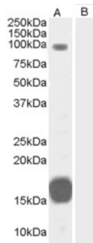
EB06142 (0.3 \mu g/ml) staining of Human Heart lysate (35 \mu g protein in RIPA buffer) with (B) and without (A) blocking with the immunising peptide. Primary incubation was 1 hour. Detected by chemiluminescence.