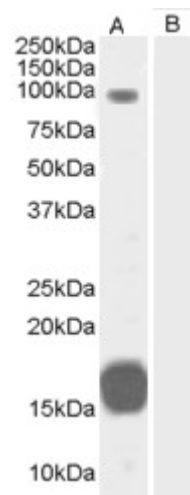
EB06142 (0.3µg/ml) staining of Human Heart lysate (35µg protein in RIPA buffer) with (B) and without (A) blocking with the immunising peptide. Primary incubation was 1 hour. Detected by chemiluminescence.