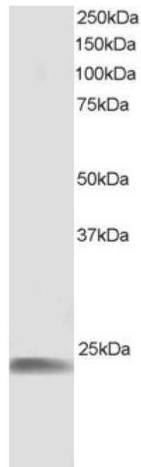
EB05677 staining (1 \mu g/ml) of Human Muscle lysate (RIPA buffer, 30 \mu g total protein per lane). Detected by chemiluminescence.