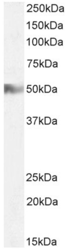
EB06905 (2 \mu g/ml) staining of Human Tonsil lysate (35 \mu g protein in RIPA buffer). Detected by chemiluminescence.