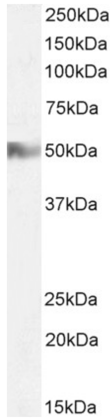
EB06905 (2µg/ml) staining of Human Tonsil lysate (35µg protein in RIPA buffer). Detected by chemiluminescence.