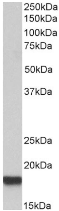
EB12862 (0.5µg/ml) staining of HeLa lysate (35µg protein in RIPA buffer). Detected by chemiluminescence.