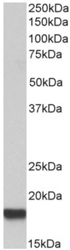
EB12862 (0.5 \mu g/ml) staining of HeLa lysate (35 \mu g protein in RIPA buffer). Detected by chemiluminescence.