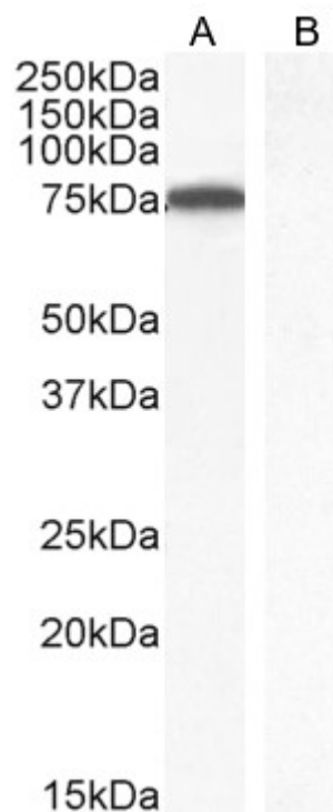
EB05117 (1ug/ml) staining of Jurkat nuclear cell lysate (A) and negative control Human parathyroid gland (B) (35µg protein in RIPA buffer). Detected by chemiluminescence.