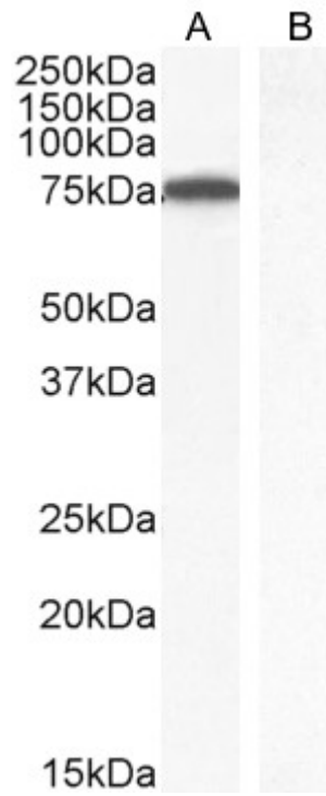
EB05117 (1ug/ml) staining of Jurkat nuclear cell lysate (A) and negative control Human parathyroid gland (B) (35µg protein in RIPA buffer). Detected by chemiluminescence.