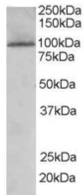
EB06455 (0.1µg/ml) staining of human liver lysate (35µg protein in RIPA buffer). Primary incubation was 1 hour. Detected by chemiluminescence.