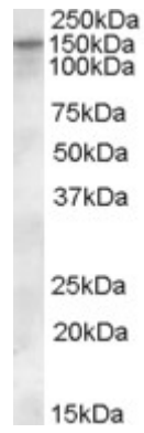
EB08088 (0.3 \mu g/ml) staining of Human Heart lysate (35 \mu g protein in RIPA buffer). Primary incubation was 1 hour. Detected by chemiluminescence.