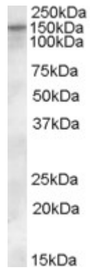
EB08088 (0.3 \mu g/ml) staining of Human Heart lysate (35 \mu g protein in RIPA buffer). Primary incubation was 1 hour. Detected by chemiluminescence.