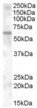
EB08538 (0.1µg/ml) staining of Human Muscle lysate (35µg protein in RIPA buffer). Primary incubation was 1 hour. Detected by chemiluminescence.