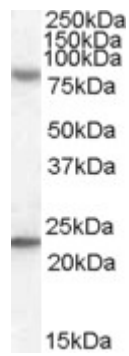
EB07981 (0.3 \mu g/ml) staining of Human Liver lysate (35 \mu g protein in RIPA buffer). Detected by chemiluminescence.