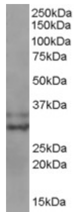
EB05088 staining (0.3 \mu g/ml) of MOLT4 lysate (35 \mu g protein in RIPA buffer). Primary incubation was 1 hour. Detected by chemiluminescence.