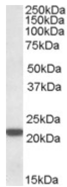
EB09445 (0.01 \mu g/ml) staining of Human Liver lysate (35 \mu g protein in RIPA buffer). Detected by chemiluminescence.