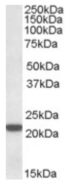
EB09445 (0.01µg/ml) staining of Human Liver lysate (35µg protein in RIPA buffer). Detected by chemiluminescence.