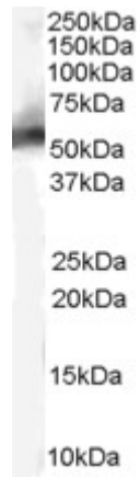
EB06990 (0.3µg/ml) staining of Human Liver lysate (35µg protein in RIPA buffer). Primary incubation was 1 hour. Detected by chemiluminescence.