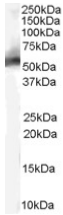
EB06990 (0.3 \mu g/ml) staining of Human Liver lysate (35 \mu g protein in RIPA buffer). Primary incubation was 1 hour. Detected by chemiluminescence.