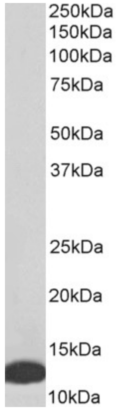
EB06765 (0.01 \mu g/ml) staining of Human Thymus lysate (35 \mu g protein in RIPA buffer). Detected by chemiluminescence.