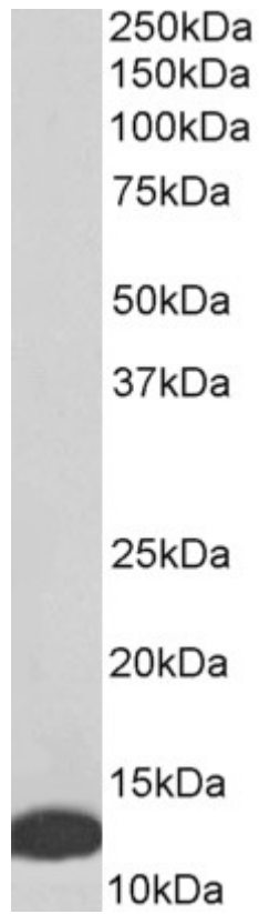
EB06765 (0.01 \mu g/ml) staining of Human Thymus lysate (35 \mu g protein in RIPA buffer). Detected by chemiluminescence.