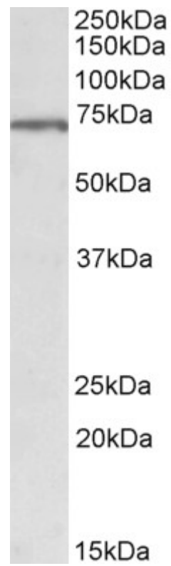
EB11998 (1 \mu g/ml) staining of Human Hippocampus lysate (35 \mu g protein in RIPA buffer). Detected by chemiluminescence.