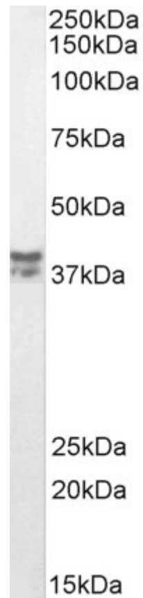
EB12531 (0.3µg/ml) staining of fetal Mouse Brain lysate (35µg protein in RIPA buffer). Detected by chemiluminescence.