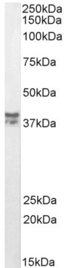
EB12531 (0.3 µg/ml) staining of fetal Mouse Brain lysate (35 µg protein in RIPA buffer). Detected by chemiluminescence.