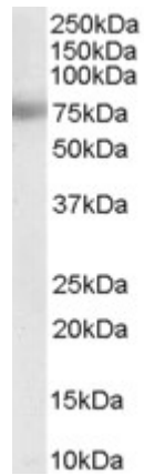
EB05163 staining (0.03 \mu g/ml) of Human Placenta lysate (RIPA buffer, 35 \mu g total protein per lane). Primary incubated for 1 hour. Detected by chemiluminescence.