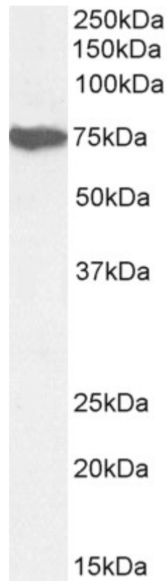
EB06140 (0.3 \mu g/ml) staining of Human Cerebellum lysate (35 \mu g protein in RIPA buffer). Detected by chemiluminescence.