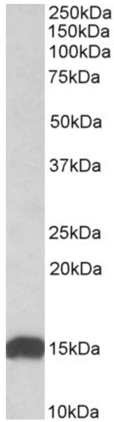
EB09788 (0.01 \mu g/ml) staining of Human Heart lysate (35 \mu g protein in RIPA buffer). Detected by chemiluminescence.