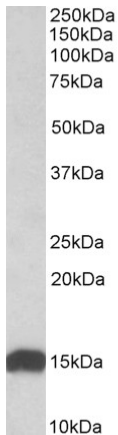
EB09788 (0.01 \mu g/ml) staining of Human Heart lysate (35 \mu g protein in RIPA buffer). Detected by chemiluminescence.