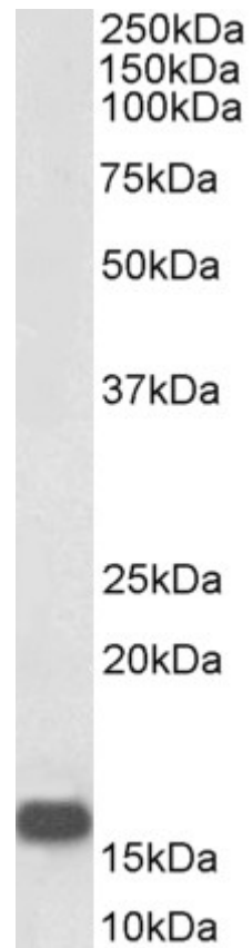
EB09686 (0.1 \mu g/ml) staining of Human Brain (Frontal Cortex) lysate (35 \mu g protein in RIPA buffer). Detected by chemiluminescence.