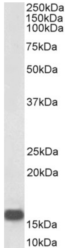
EB09686 (0.1µg/ml) staining of Human Brain (Frontal Cortex) lysate (35µg protein in RIPA buffer). Detected by chemiluminescence.