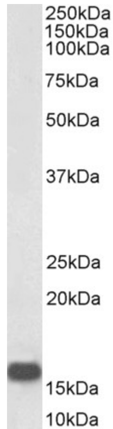
EB09686 (0.1µg/ml) staining of Human Brain (Frontal Cortex) lysate (35µg protein in RIPA buffer). Detected by chemiluminescence.