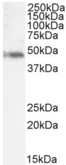
EB10589 (1 \mu g/ml) staining of Daudi cell lysate (35 \mu g protein in RIPA buffer). Detected by chemiluminescence.