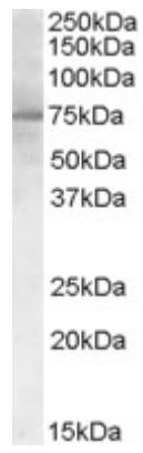
EB06682 (0.3 \mu g/ml) staining of Human Adipose lysate (35 \mu g protein in RIPA buffer). Detected by chemiluminescence.