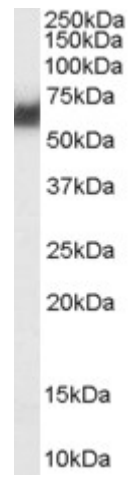
EB07722 (0.03 \mu g/ml) staining of Human Pancreas lysate (35 \mu g protein in RIPA buffer). Detected by chemiluminescence.