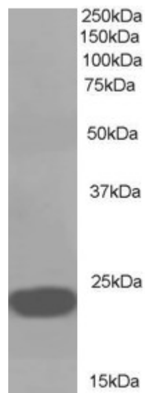
EB05403 (1 \mu g/ml) staining of A549 lysate (35 \mu g protein in RIPA buffer). Detected by chemiluminescence.