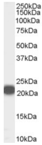
EB07477 (0.01 \mu g/ml) staining of Human Prostate lysate (35 \mu g protein in RIPA buffer). Primary incubation was 1 hour. Detected by chemiluminescence.