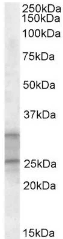
EB09427 (1µg/ml) staining of Human Heart lysate (35µg protein in RIPA buffer). Primary incubation was 1 hour. Detected by chemiluminescence.