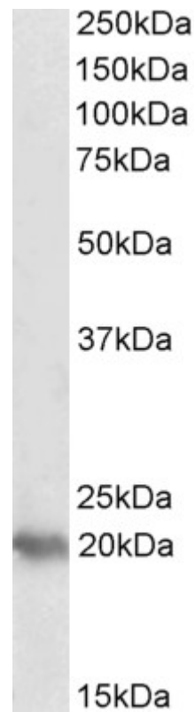
EB07234 (1 \mu g/ml) staining of Human Liver lysate (35 \mu g protein in RIPA buffer). Primary incubation was 1 hour. Detected by chemiluminescence.