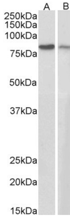
EB05500 (0.3 \mu g/ml) staining of A431 (A) and NIH3T3 (B) cell lysates (35 \mu g protein in RIPA buffer). Primary incubation was 1 hour. Detected by chemiluminescence.