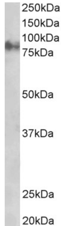
EB05500 staining (1 \mu g/ml) of Rat Eye lysate (RIPA buffer, 35 \mu g total protein per lane). Primary incubated for 1 hour. Detected by chemiluminescence.