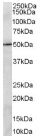
EB05718 (2 \mu g/ml) staining of A549 lysate (35 \mu g protein in RIPA buffer). Primary incubation was 1 hour. Detected by chemiluminescence.