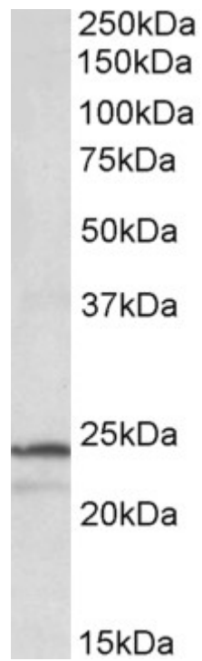
EB10294 (1 \mu g/ml) staining of K562 lysate (35 \mu g protein in RIPA buffer). Primary incubation was 1 hour. Detected by chemiluminescence.