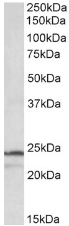
EB10294 (1 \mu g/ml) staining of K562 lysate (35 \mu g protein in RIPA buffer). Primary incubation was 1 hour. Detected by chemiluminescence.