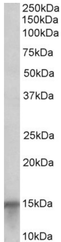
EB07277 (0.1 \mu g/ml) staining of Human Skin lysate (35 \mu g protein in RIPA buffer). Primary incubation was 1 hour. Detected by chemiluminescence.